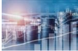
Banking and insurance