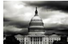
Public sector and services